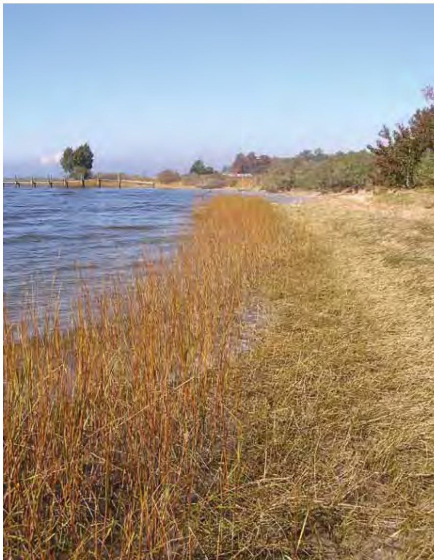
Figure 2. Picture of a typical brackish fringe marsh. Notice the taller plants are at the water's edge and shorter plants grow further into the land.

As the paragraph above illustrates, all the marshes along the Essex County shoreline serve as food and habitat for aquatic