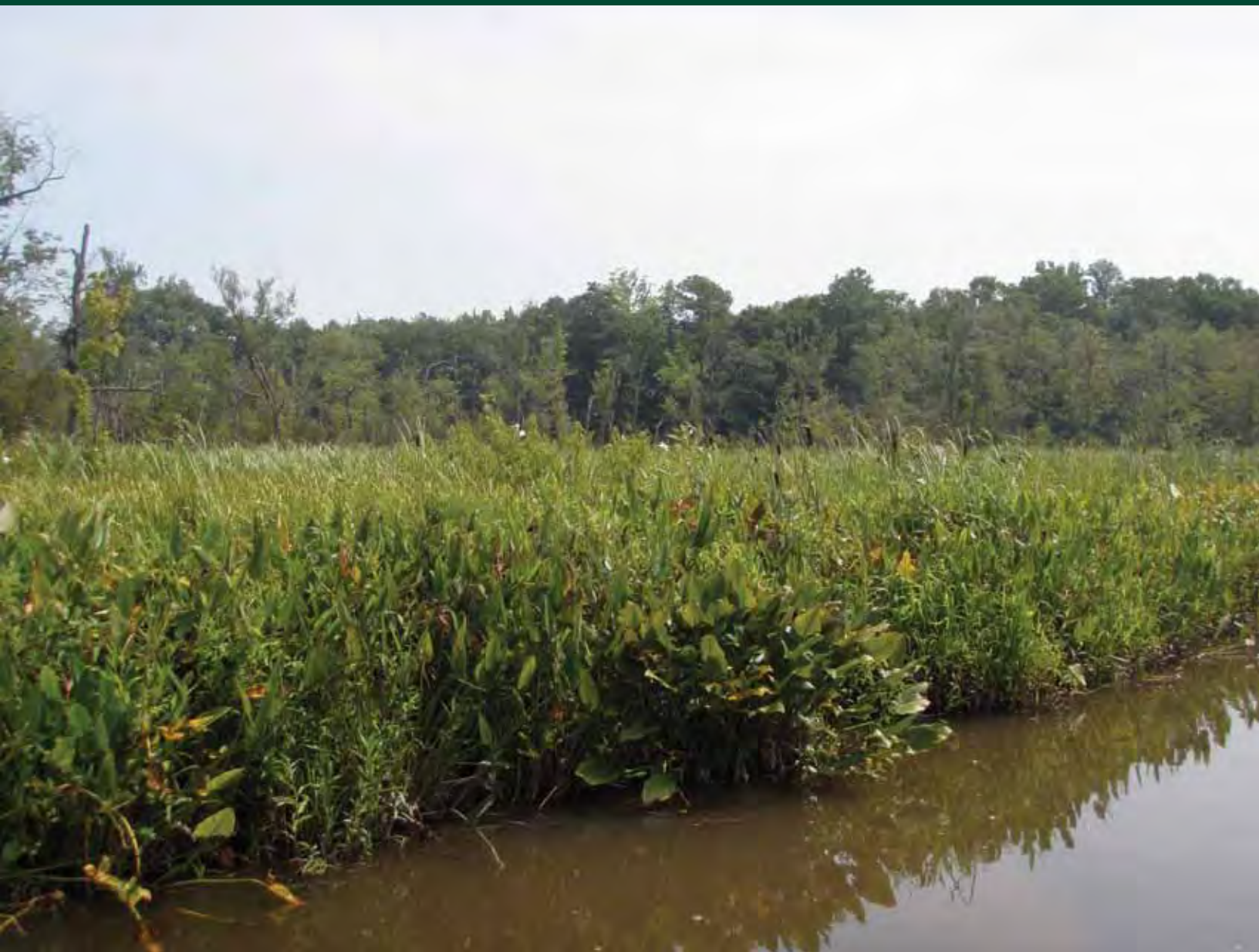
Figure 3. Picture of a typical freshwater marsh. There are many different plants growing in the marsh and the plants at the edge of the water tend to be the shortest ones.

animals and birds. However, there are frequently differences in the species that benefit from each type of marsh. For example, king rails use big cordgrass extensively but are not found in arrow arum communities (Wilson and Watts, 2010). Anadromous fish (fish that spawn in freshwater but live their adult lives in seawater) require freshwater marshes to complete their life cycles. Without freshwater marshes to spawn in, these fish species (e.g., shad, herring) will stop reproducing