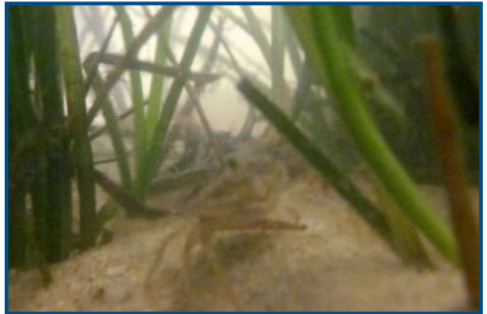
In the Grass: Thicker seagrass beds provide better nursery habitat for juvenile blue crabs.