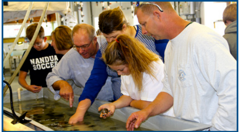
Bay Scallop Restoration: Eastern Shore residents enjoyed learning about the research and efforts being done at VIMS Eastern Shore Lab to restore scallops in Chesapeake Bay.

VIMS' Eastern Shore Laboratory (ESL) serves as both a field station and a site for resident research in coastal ecology and aquaculture. By virtue of its access to unique coastal habitats, excellent water quality, and an extensive seawater laboratory, the ESL affords educational and research opportunities not available elsewhere within the region. Over its 40-year history, the laboratory has become internationally recognized for shellfish research, with important contributions to molluscan ecology and culture.