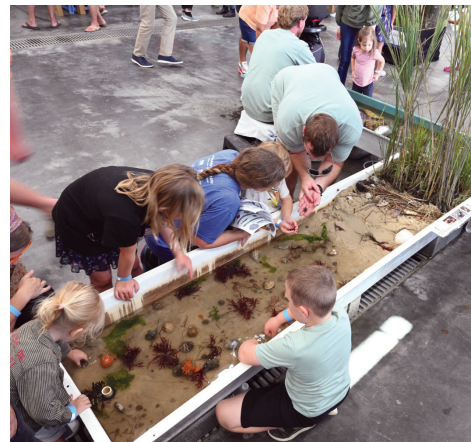
> The VIMS Eastern Shore Lab's Marine Life Day touch tank provides hours of fun and remains open for local field trips the following week.

for the first time, we hosted a marine science career fair, sponsored by Bank of America, where 115 attendees learned about the multitude of careers available in marine science and related fields.