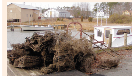
> Derelict crab traps are offloaded for disposal after being removed from the Chesapeake Bay.

The new Nationwide Fishing TRAP (Trap Removal, Assessment, & Prevention) Program will fund removal of pots and traps used to harvest crabs and lobsters and establish a lab to synthesize data and inform prevention and mitigation policies at the state and federal levels.