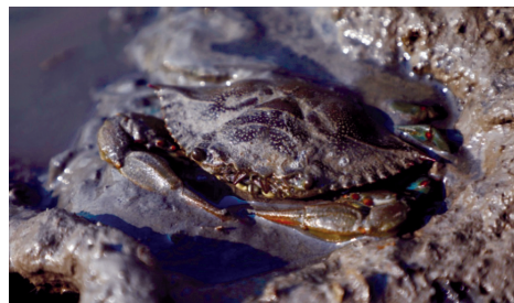
> A mud-coated blue crab begins to emerge from its ambush pit during low tide within a coastal salt marsh.