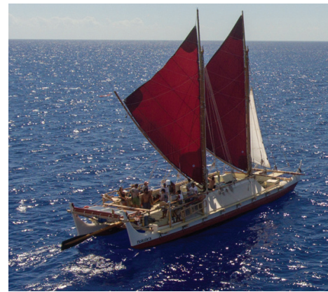
> The Hokule’a was built in 1975 in the tradition of an ancient Polynesian double-hulled voyaging canoe.