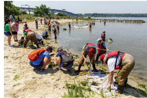
> On Marine Science Day, both children and lifelong learners are able to have hands-on educational experiences.

Have you ever wondered what happens behind the scenes at the Virginia Institute of Marine Science? Maybe you've asked yourself, "What do marine scientists really do?" At this year's Marine Science Day on VIMS'