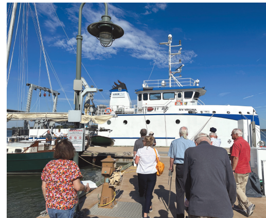
> A group of donors tour the R/V Virginia in late October.