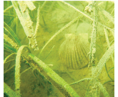
> Eelgrass beds help protect bay scallops from predators and strong currents.

In September, VIMS opened the R/V Virginia to the public in Norfolk for free tours as part of a broader outreach and education event. Our display tent provided hands-on learning, with authentic tools and exciting artifacts, including shark jaws. On the public tours, enthusiastic attendees discovered the vessel's state-of-the-art capabilities and heard insights surrounding the latest research endeavors from VIMS scientists and members of the R/V Virginia 's crew.