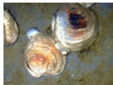
Figure 2: Two adult hard clams. These animals are approximately 80 mm long.

and fishery managers are concerned about the potential effects that rapa whelk predation might have on hard clam stocks. A large rapa whelk population living among the hard clams has the potential to eat many clams and potentially reduce the fishermen's catch. Thus the question "How many clams could a rapa whelk eat in a year?" has real scientific and economic implications.