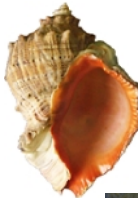
Figure 1: An adult rapa whelk from the lower Chesapeake Bay. This animal's shell is 165 mm long.

Hard clams are commercially fished in the lower Chesapeake Bay, so humans are interested in where the clams are too! The local hard clam fishery is worth more than $3 million dollars each year. Hard clam fishermen