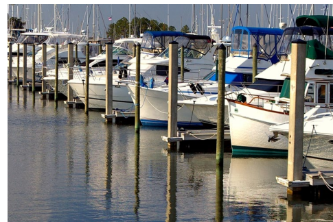
Harbor Boats

Are your life jackets or flares out-of-date? If so, check out the BoatUS Life Jacket Loaner Program and the American